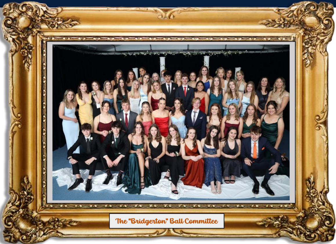
The "Bridgerton" Ball Committee