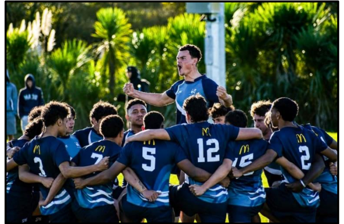
Congratulations to the Kerikeri High School students who competed in the Senior Turbo Touch Championship event. Our Mixed Team placed 1st and our Girls' Team placed 3rd.